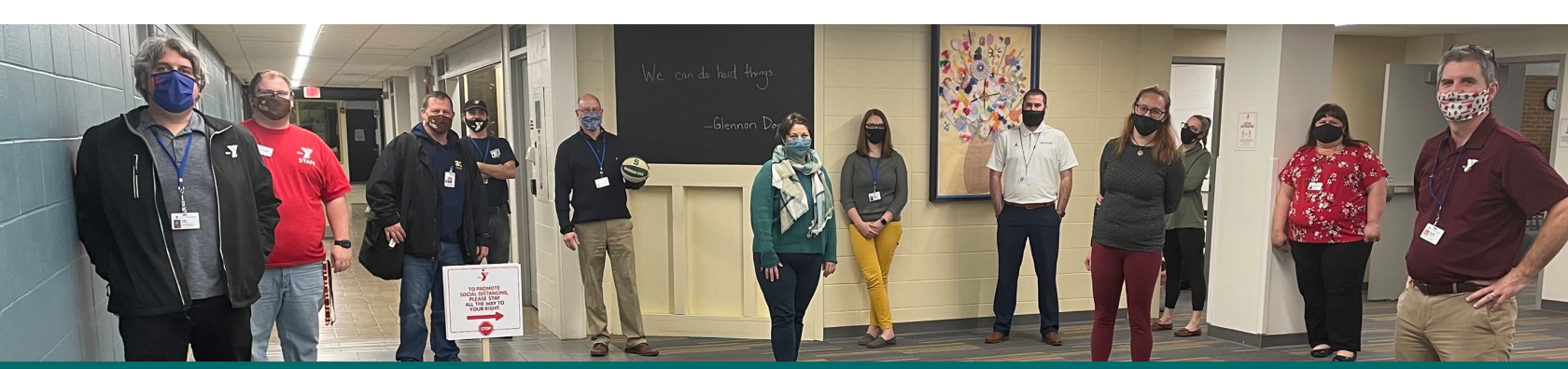
FOR A BETTER COMMUNITY. FOR A BETTER US.

YMCA of Greater Kalamazoo 1001 W. Maple St. Kalamazoo, MI 49008