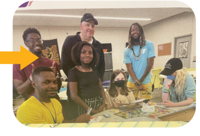
139 teens took part in afterschool programming, and 427 youth were enrolled in Prime Time (before and after school program.)