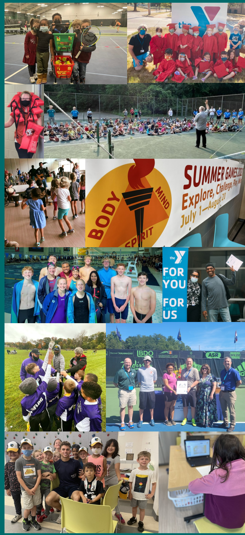
President and CEO YMCA of Greater Kalamazoo