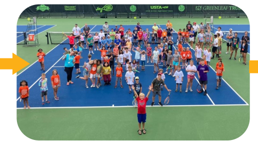
608 youths participated in tennis programs across Maple and Portage Y's.