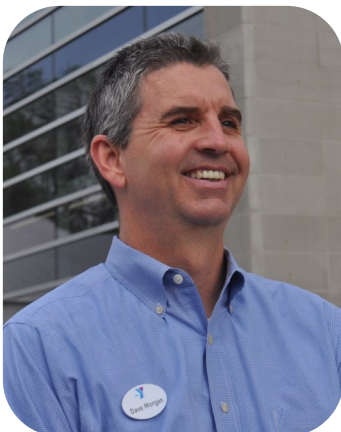
President and CEO YMCA of Greater Kalamazoo

Finally, let me thank all of you. We would not have been able to respond to the biggest crisis of our lifetime as quickly and thoroughly without our community partners, members, donors, volunteers, and staff. While our work is far from over, you should all be proud of the great things that we accomplished – together – in 2020.